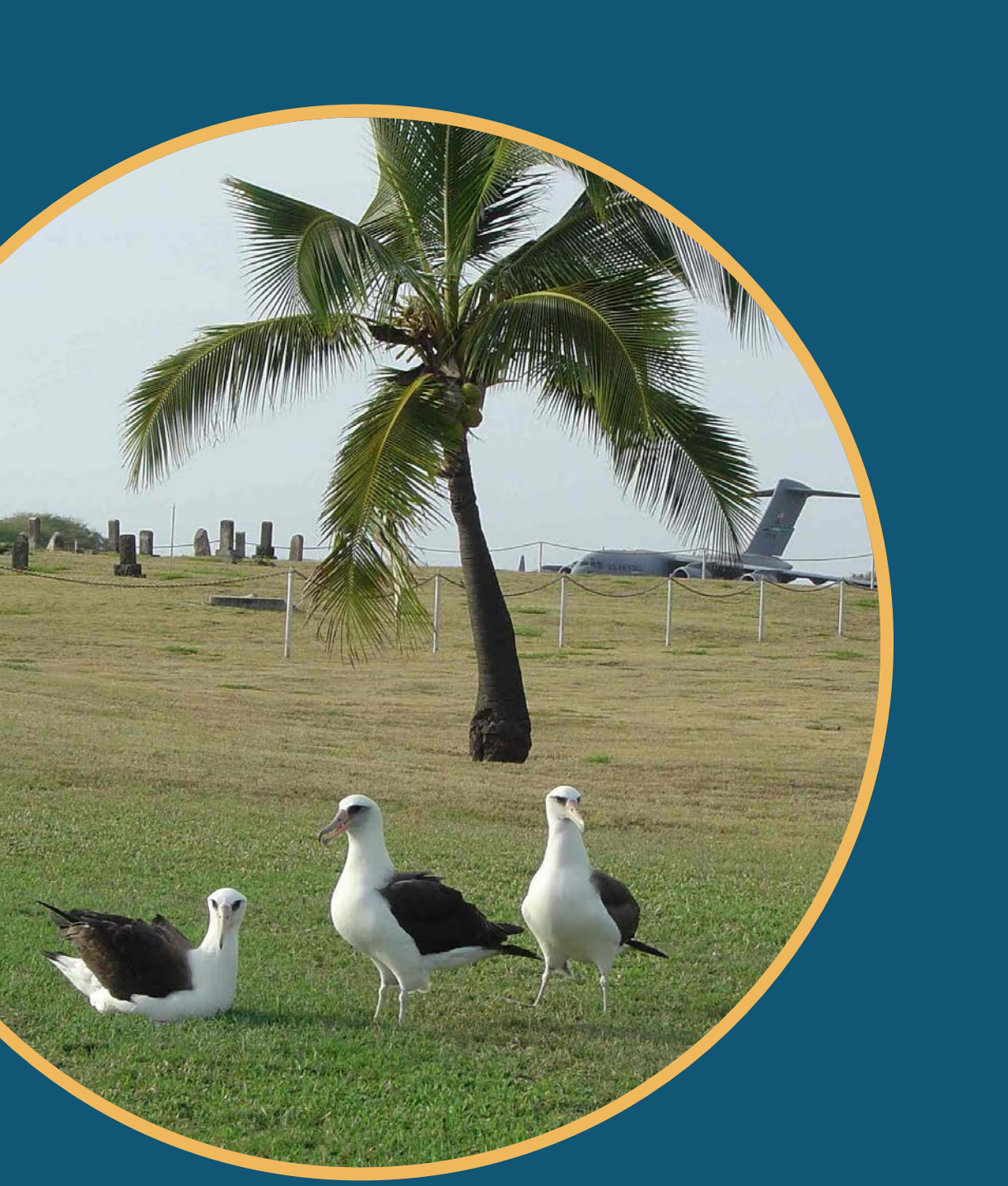
Laysan albatross at PMRF